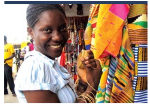
A Ghanaian woman shows off her locally made bamboo bracelets in Accra, Ghana.

Africa Renewal offers free subscriptions to individual readers. Please send your request to Circulation at the address to the left or by e-mail to africarenewal@un.org . Institutional subscriptions are available for thirty-five US dollars, payable by international money order or a cheque in US dollars drawn on a US bank, to the "United Nations" and sent to Circulation at the address to the left.