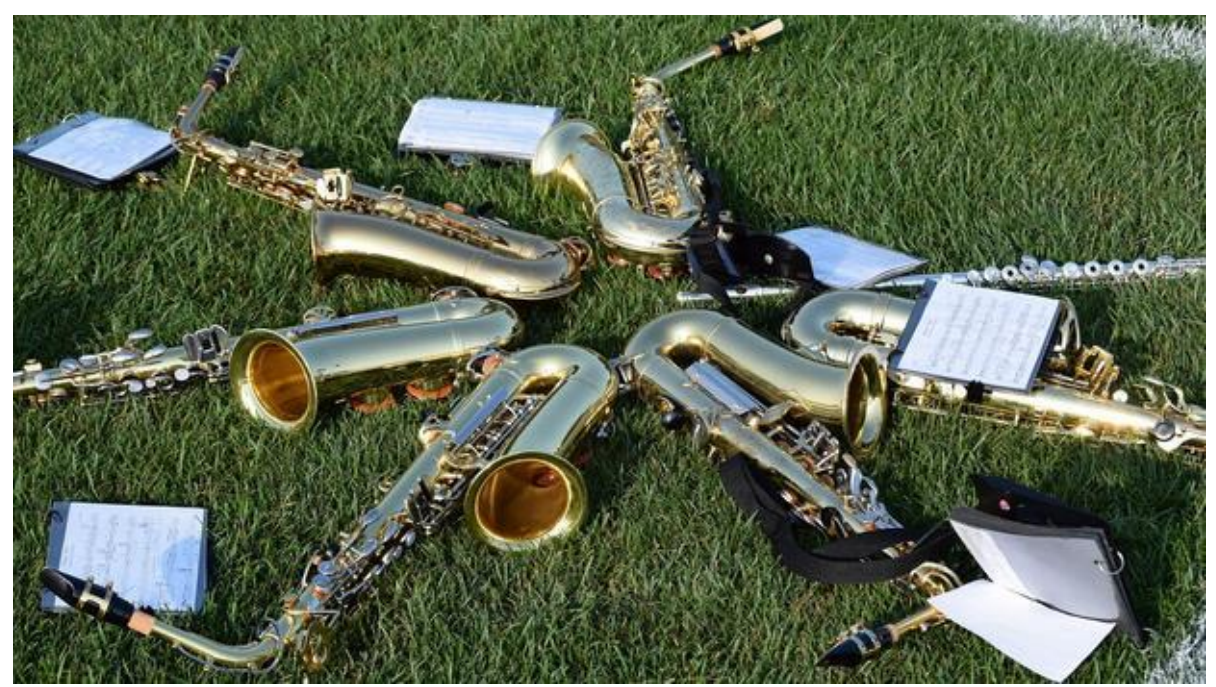
International Jazz Day takes place every year on April 30.

INTERNATIONAL / 30 APRIL 2018, 2:15PM / MASEGO PANYANE