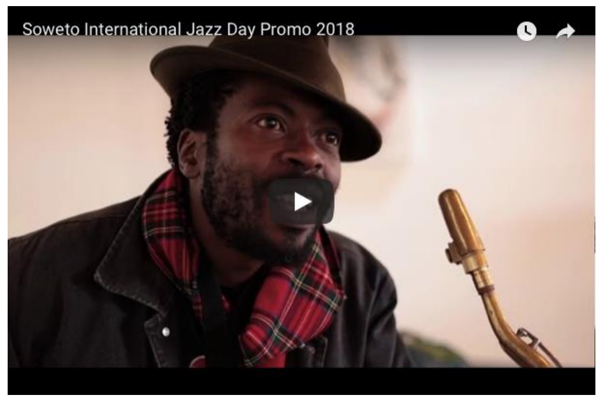
A snippet of the performances expected at the International Jazz Day celebration happening at the Eyethu Lifestyle Center in Mofolo, Soweto.

A series of educational and outreach programmes will take place in the Global Host City, where the Day will culminate in an extraordinary all-star concert at the historic Mariinsky Theatre, an event which will be streamed live worldwide.