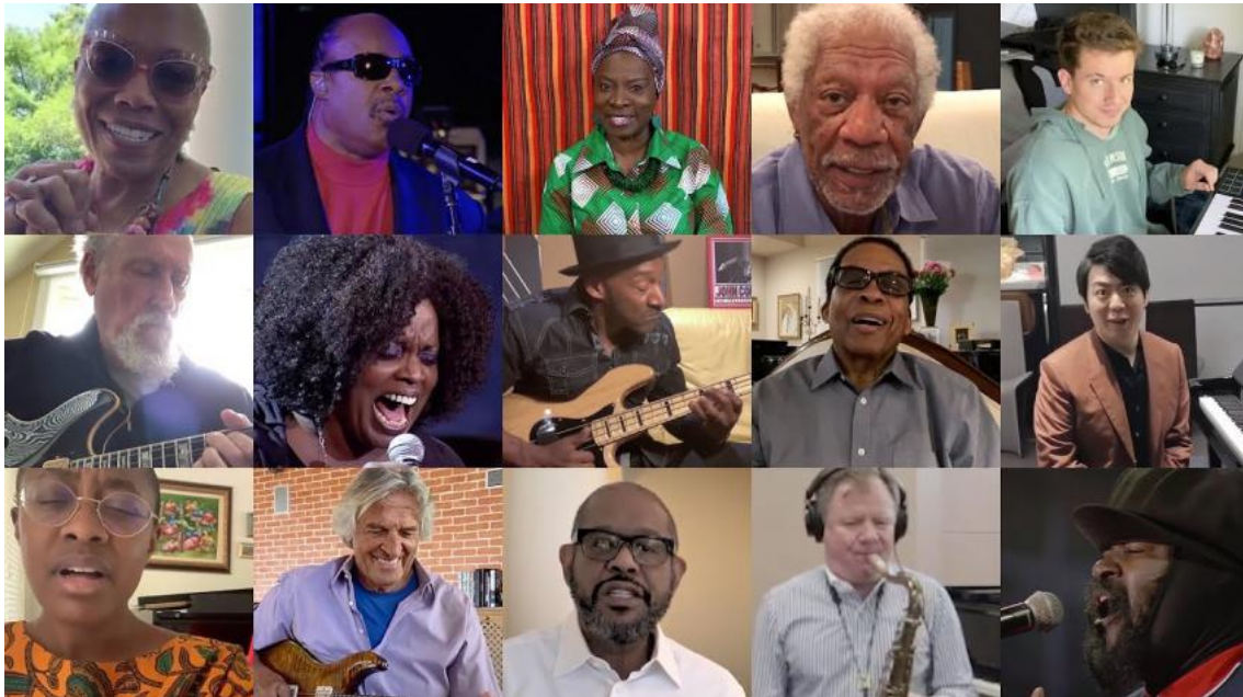
Artists live-stream their music from their homes during a virtual global jazz concert on International Jazz Day.

Home Secretary-General Stories UN News For UN Personnel » For Member States UN System Women Rise for All Youth Resources FAQs