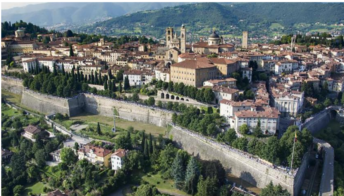
Bergamo in Italy opens museums virtually in response to confinement.