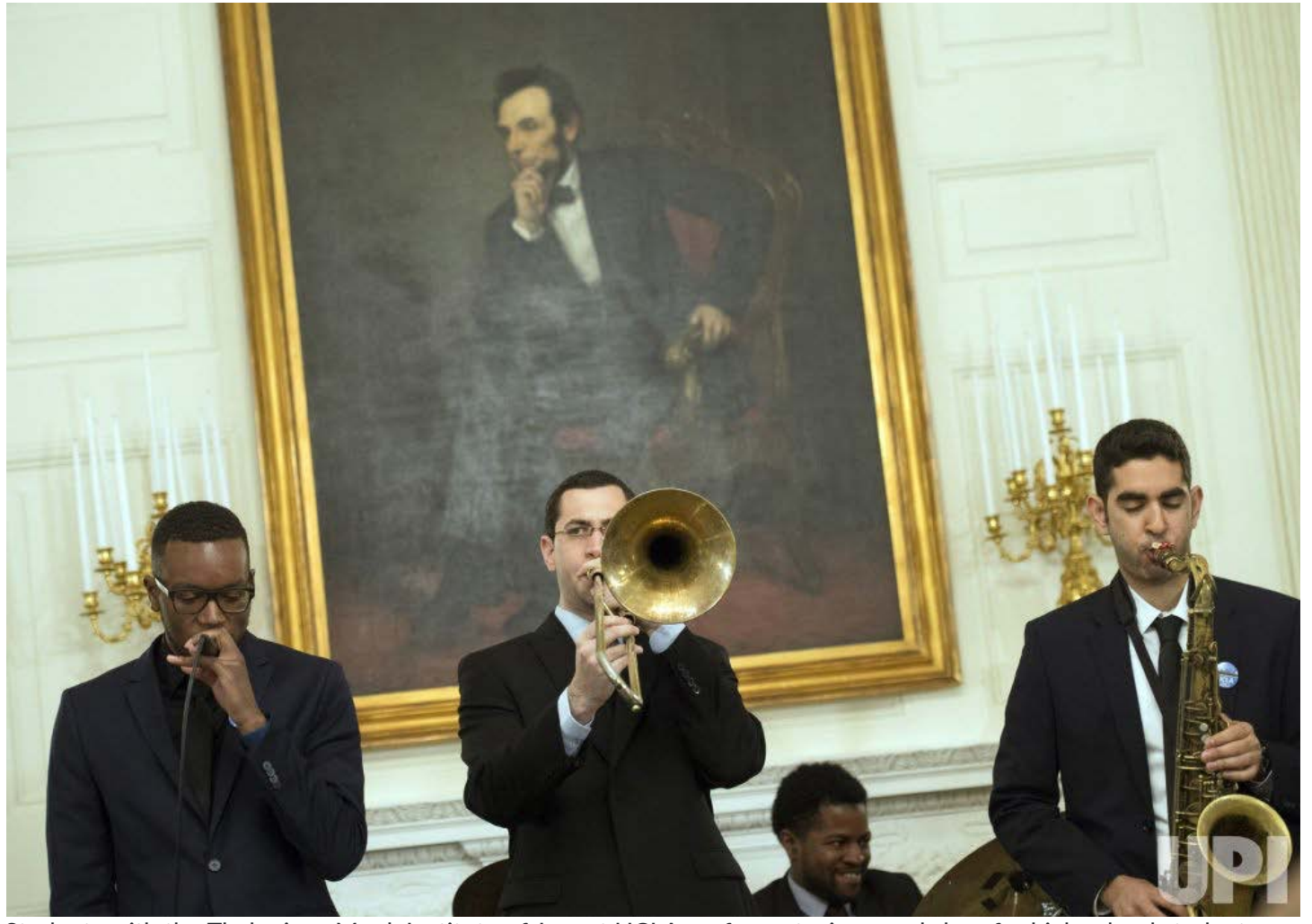
Students with the Thelonious Monk Institute of Jazz at UCLA perform at a jazz workshop for high school students hosted by first lady Michelle Obama at the International Jazz Day celebration at the White House, in Washington D.C. on April 29, 2016.