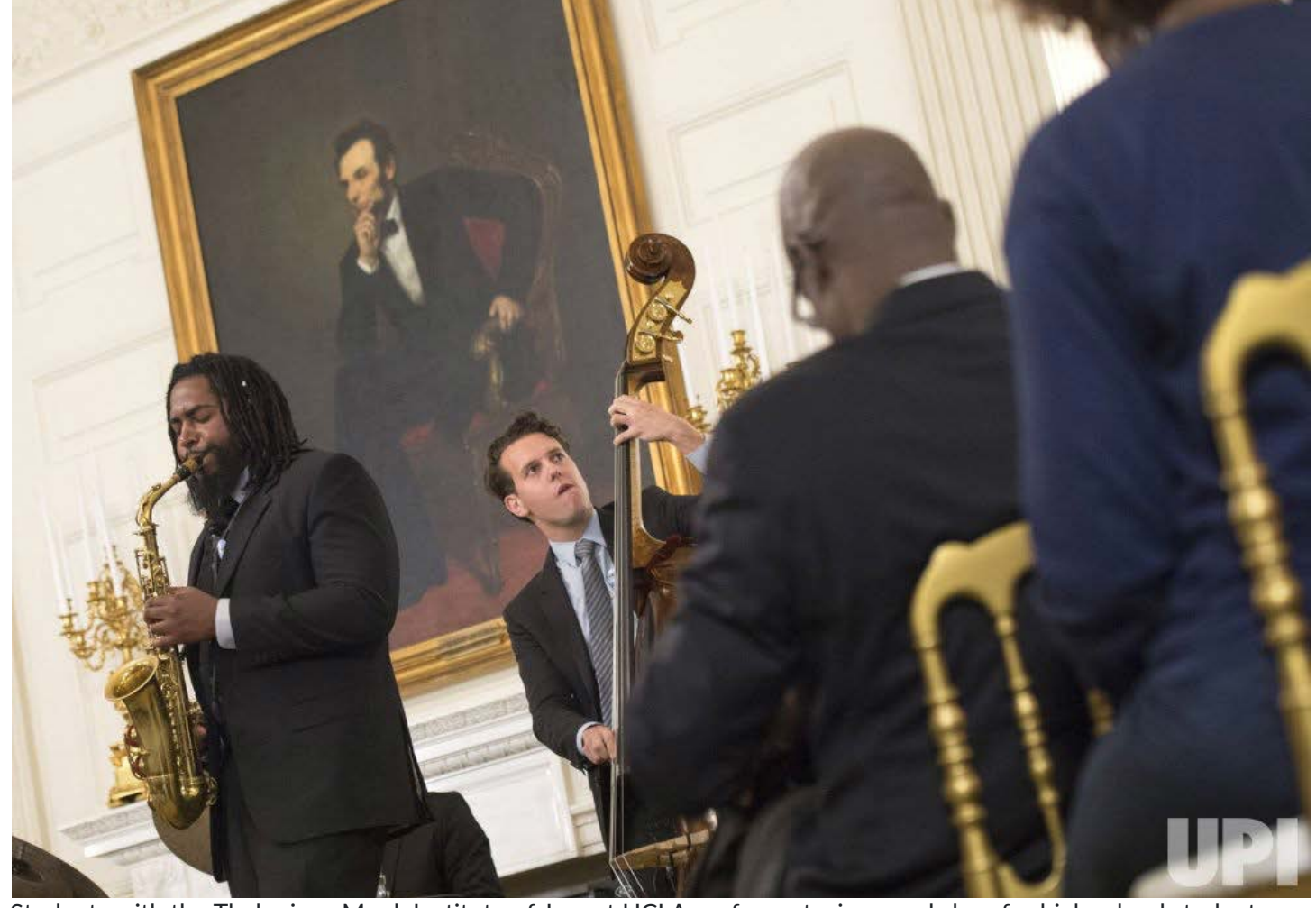
Students with the Thelonious Monk Institute of Jazz at UCLA perform at a jazz workshop for high school students hosted by first lady Michelle Obama at the International Jazz Day celebration at the White House, in Washington D.C. on April 29, 2016.